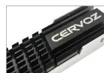
M.2 2280 Heatsink

To avoid overheating cause performance affected and shorten storage longevity, Cervoz M.2 2280 heatsink which can efficiency to accelerate heat dissipation.